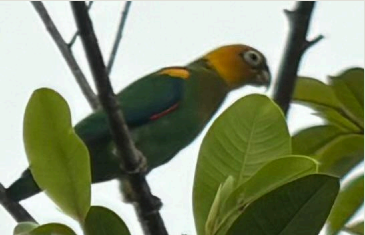
Saffron-headed Parrot.