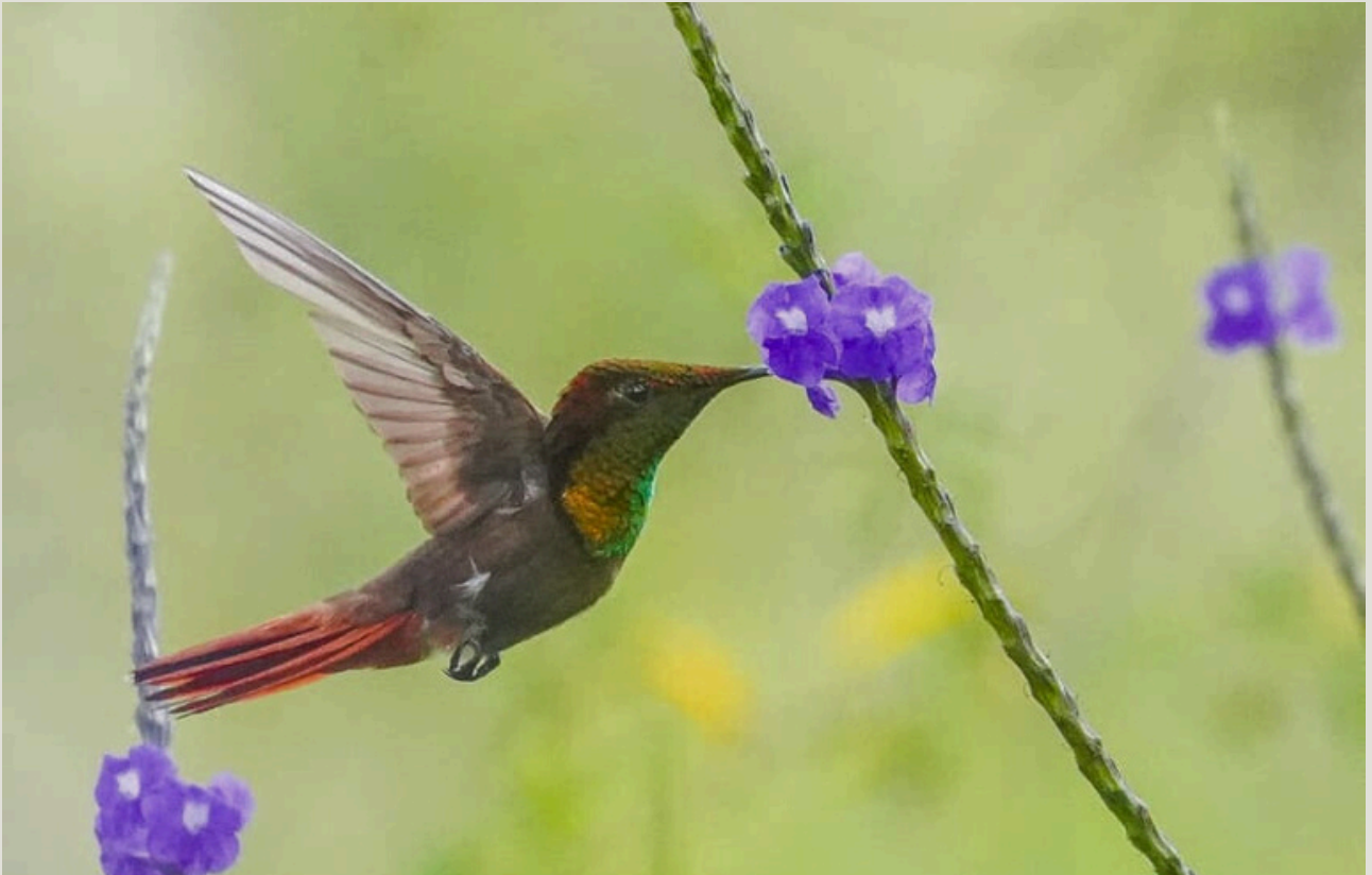
Ruby Topaz Hummingbird