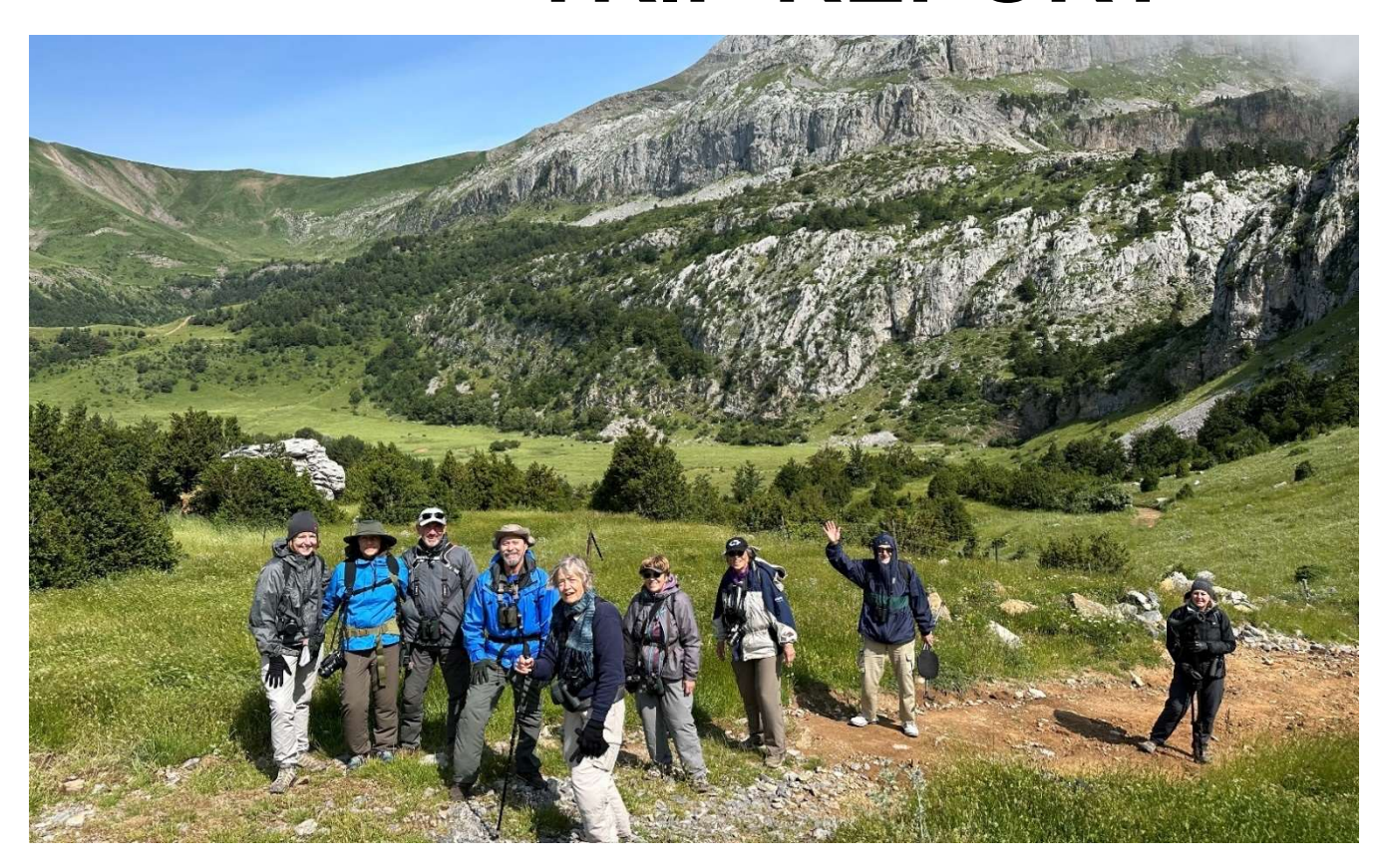
Black-crowned Pitta, Western Tarsier, Giant Pitta - Group at Litaria