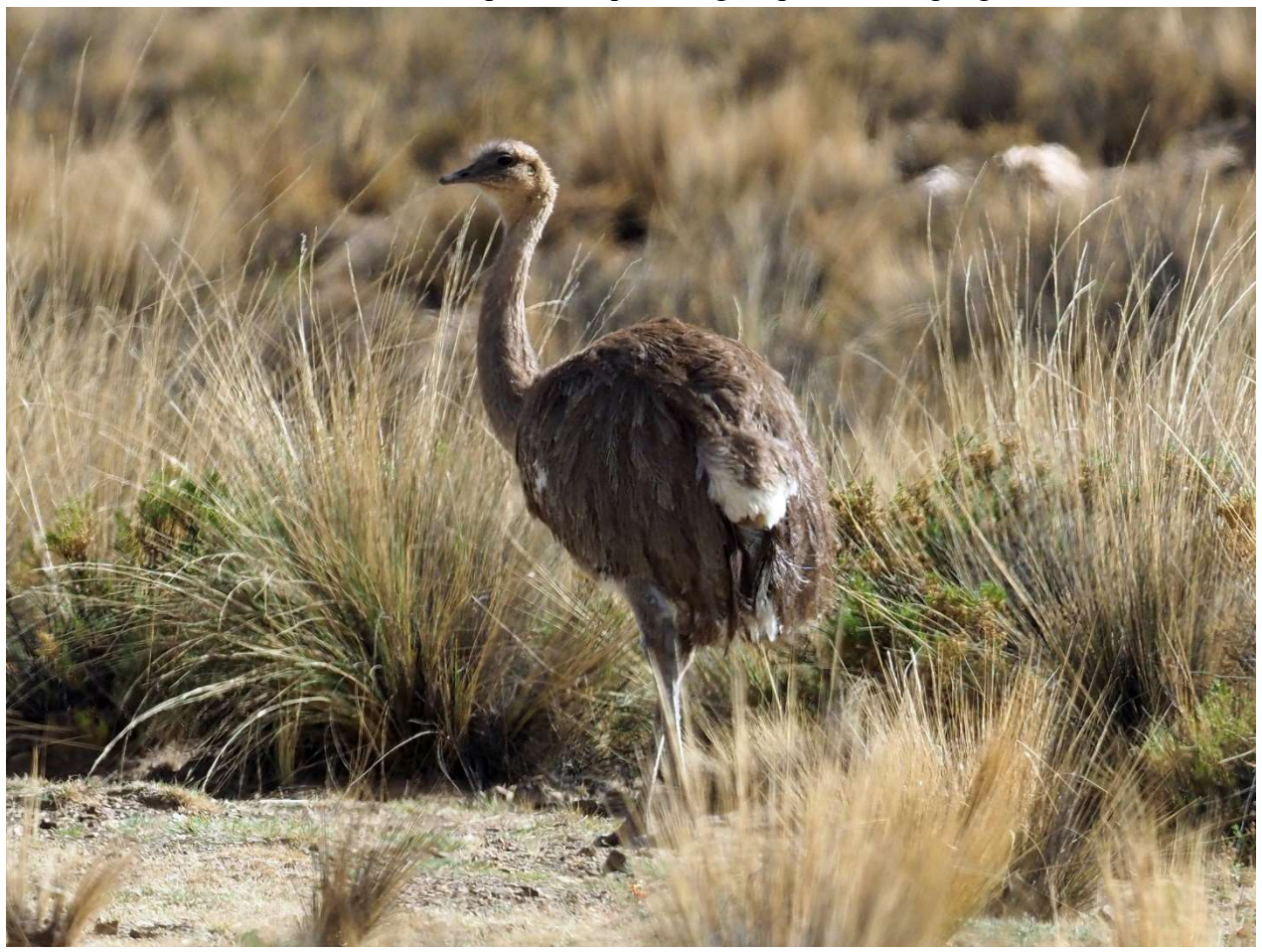
race of Lesser Rhea , including one with several chicks. After a last stop in the bordering town of La Quiaca, we finally arrived at Yavi, where we were welcomed by a group of very range restricted Citronheaded Yellow Finches.

mammal list. Our main target was then found along the shores of the main lake, and we were delighted with four Puna Plovers. Also, here we spotted some distant flamingos, coots, Baird's Sandpiper, many Andean Avocets, White-backed Stilt, Crested Duck and few others species we had previously spotted. Later on, we made a visit to the smaller Lagunillas, and here we were extremely lucky to find the rare Hooded Coot, a species that is only around if the water levels and conditions are perfect. Also here were Giant Coot and Andean Goose. To complete the quite long loop drive, we got great looks at the Puna