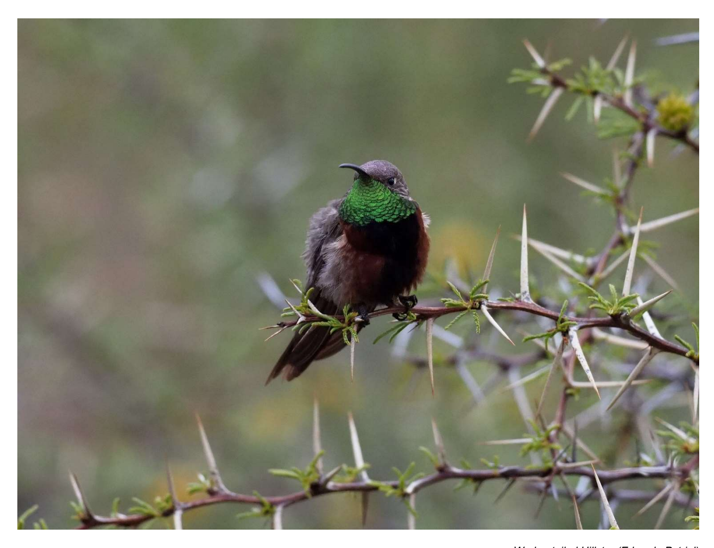
Wedge-tailed Hillstar