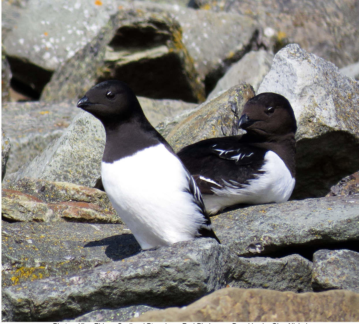
Photos: King Eiders, Svalbard Ptarmigan, Red Phalarope, Dovekies by Gina Nichol