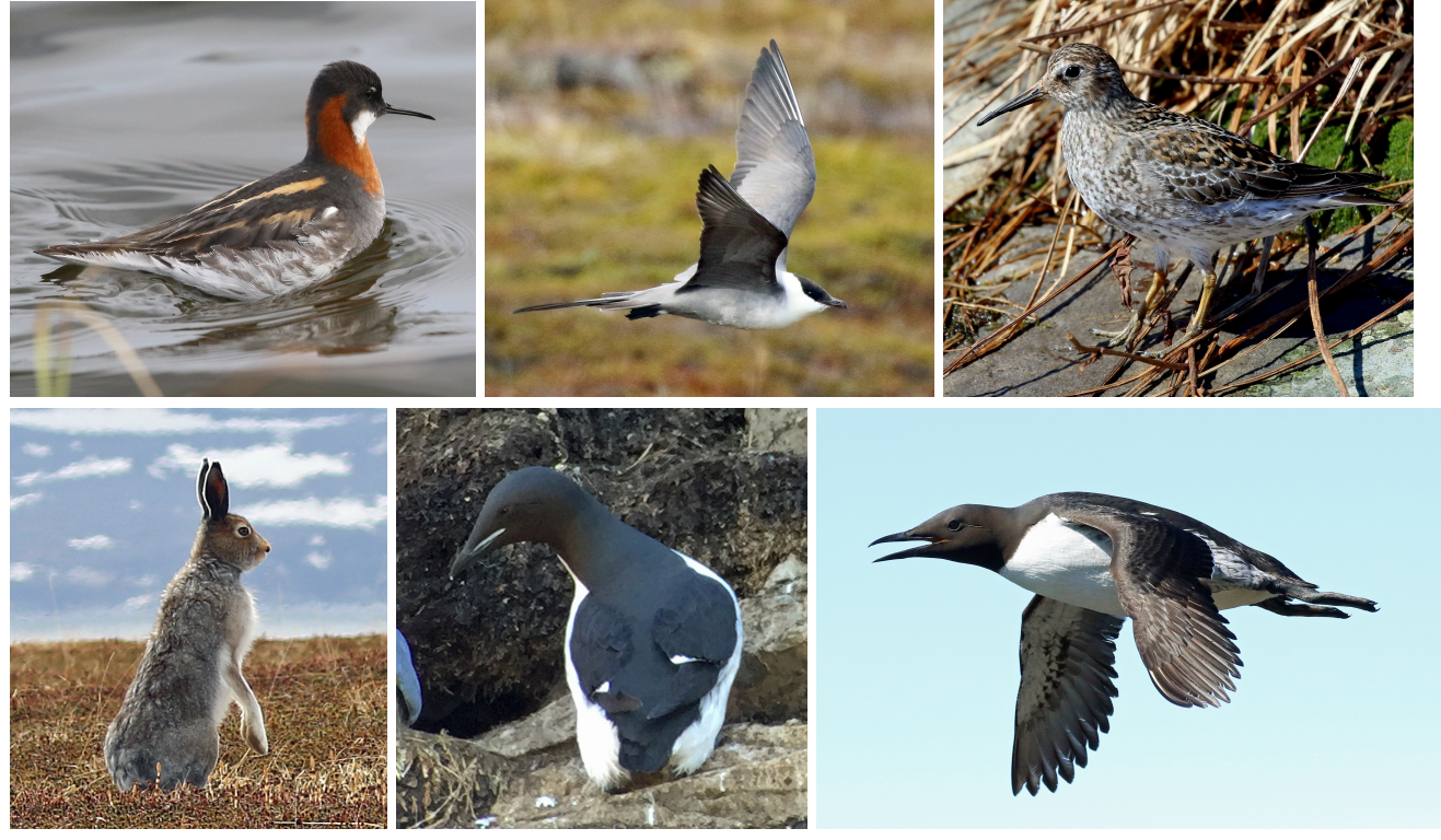
Photos: Red-necked Phalarope, Long-tailed Skua, Purple Sandpiper, Mountain Hare, Thisck-billed Murre, Common Murre by Steve Bird.