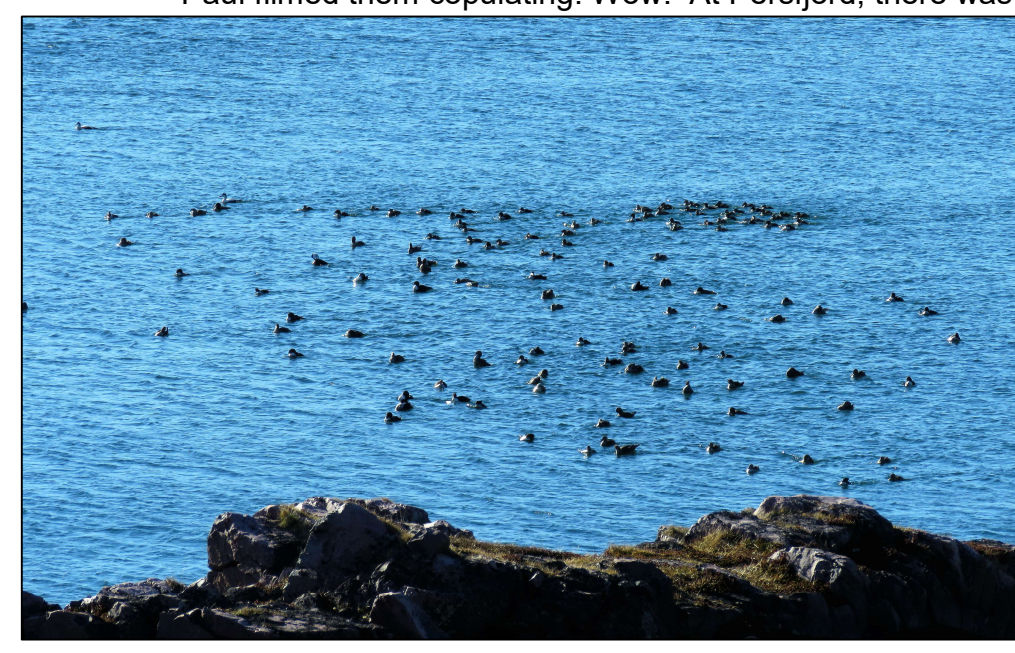
SUNRISE BIRDING LLC - 2017 NORWAY BIRDING TOUR - TRIP REPORT

We continued further today on the road to Hamningberg stopping at Persfjord Bay where we found White-billed Diver, Goosanders, Long-tailed Ducks, and another Peregrine. The stunning landscape was illuminated by a clear blue sky and we marveled at the geologic formations, the beaches and the calm sea. Near the border of Vardø and Batsfjord, we had great views of Ring Ouzel. A stop at Sandfjord found us Arctic Redpolls in the willows, a Stoat scampering along the shoreline and some butterflying Temminck's Stints. At Hamningberg, we had Northern Gannets, both Skuas, a Peregrine and a Fin Whale close to shore. On the way back at Sandfjord, there was a pair of Red-necked Phalaropes in the river and at one point Paul filmed them copulating. Wow! At Persfjord, there was