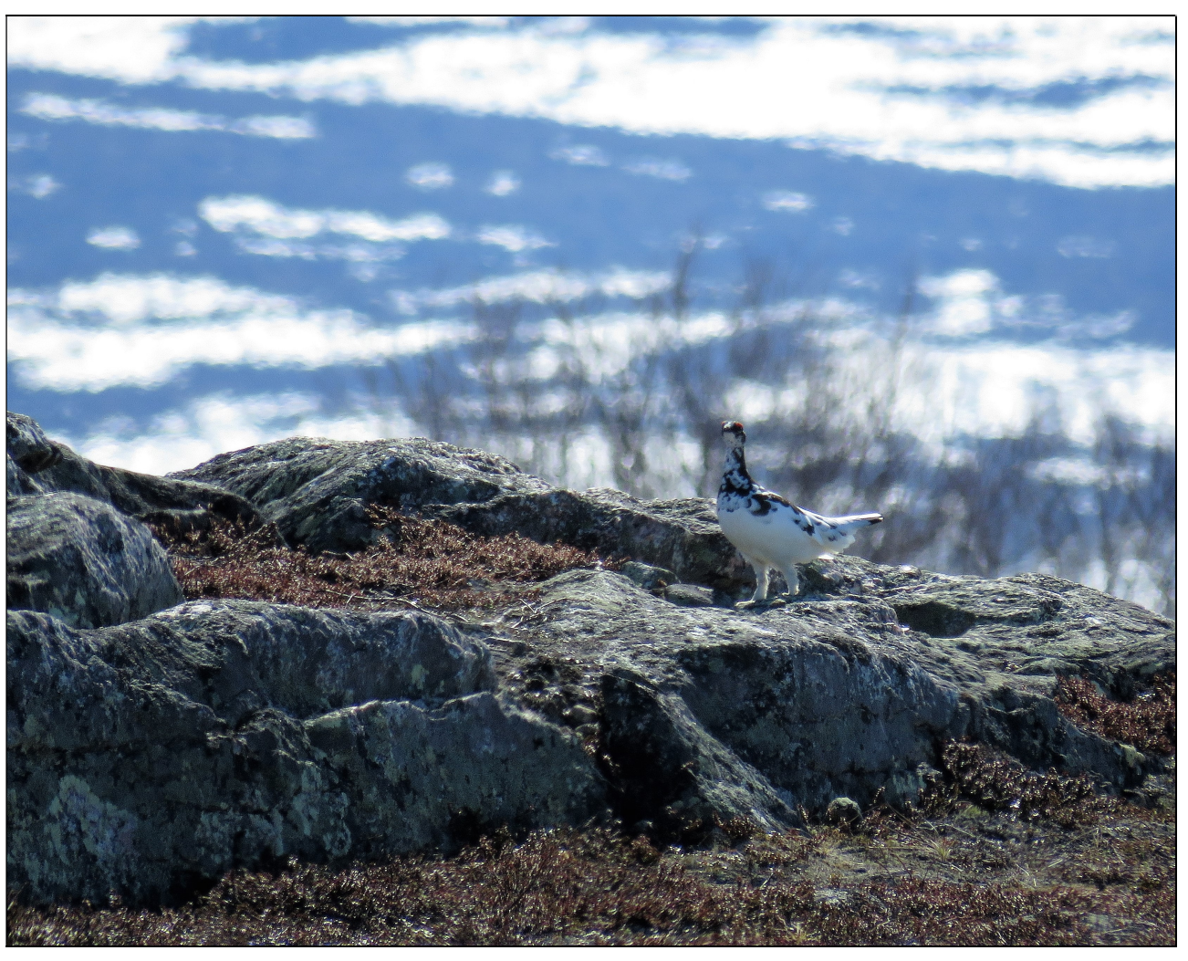
SUNRISE BIRDING LLC - 2017 NORWAY BIRDING TOUR - TRIP REPORT

into our hotel and shared our highlights of both the Finland and Norway tours after another delicious meal.