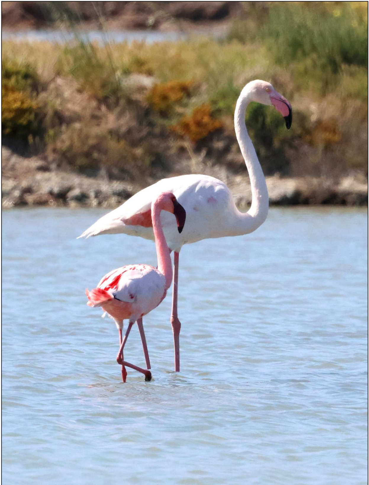
Here the much smaller, dark billed Lesser Flamingo seen in direct comparison the larger Greater!

One day we went for the 4 th record for the whole of Greece - a Lesser Flamingo had turned up at one of the Salt Pans. We don't usually chase birds on the island as we are normally the ones to find the rarities, but this was special.