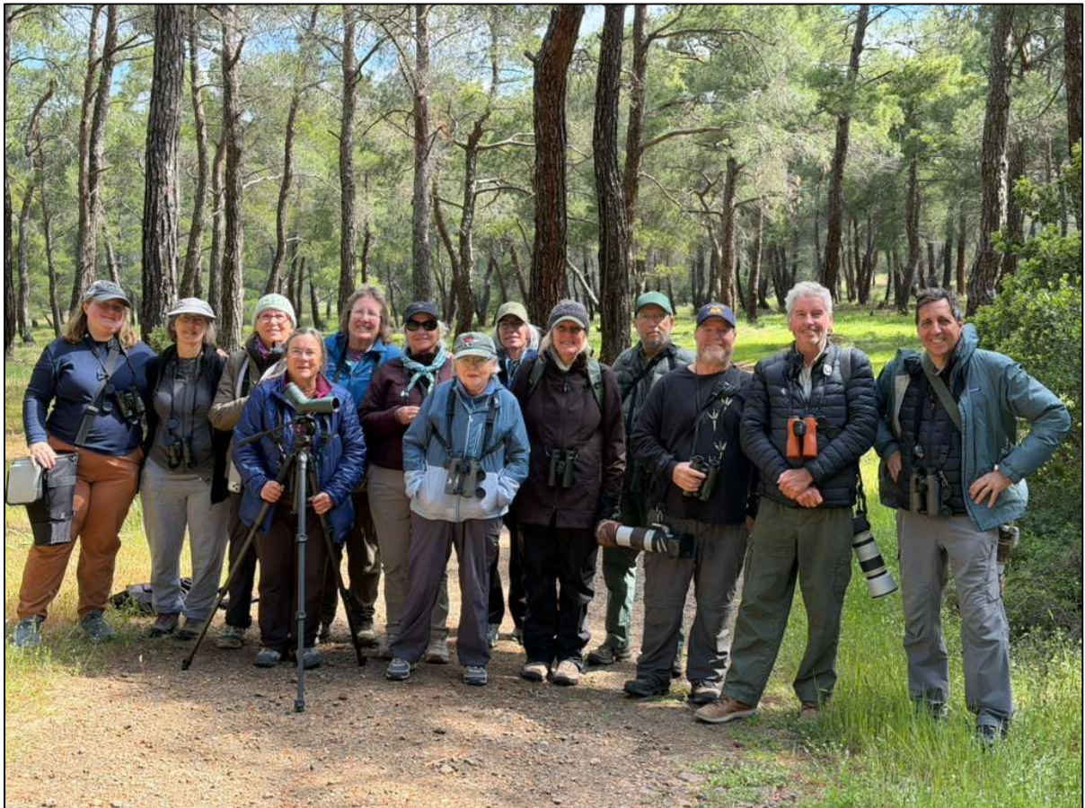
And here we are after seeing a lovely pair of Krüper's Nuthatch !