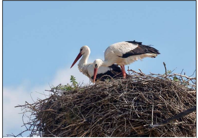
This pair of White Storks have been nesting on a pole in the center of Kalloni Town for many years