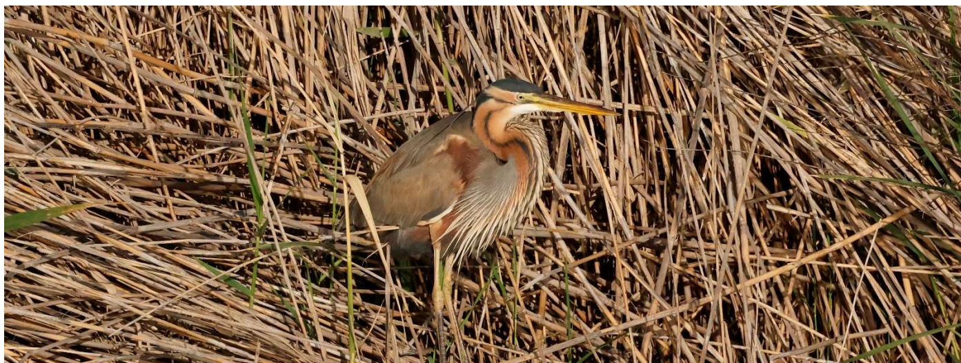
One of our favorite morning spots, the inland lake of Metochi offers fabulous light in the morning. Here a Purple Heron blends in nicely with the reedy background.