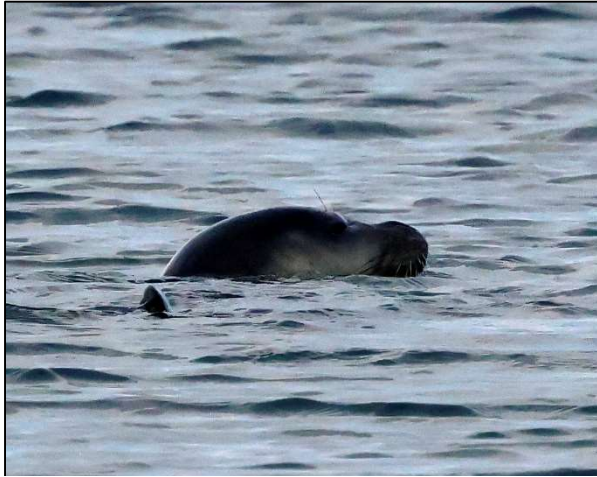
This Mediterranean Monk Seal caused the biggest twitch on the island with around 100 people turning up to seal this incredibly rare mammal just outside our hotel.

And here are just a few of the other things we saw.