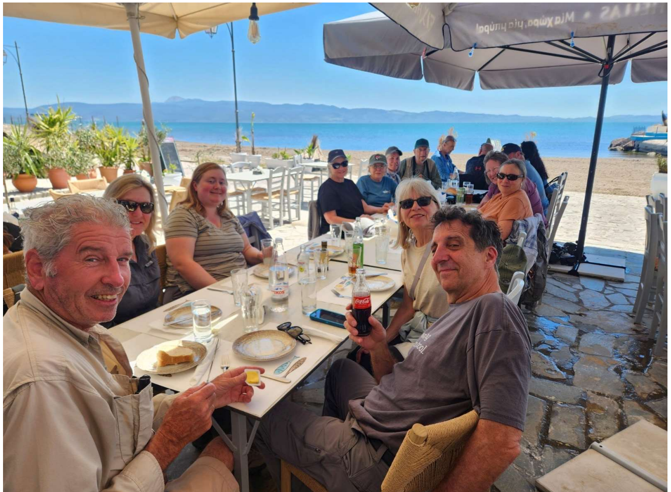
Just waiting for our taverna lunch to arrive. Excellent photo by Cheryl Blum!