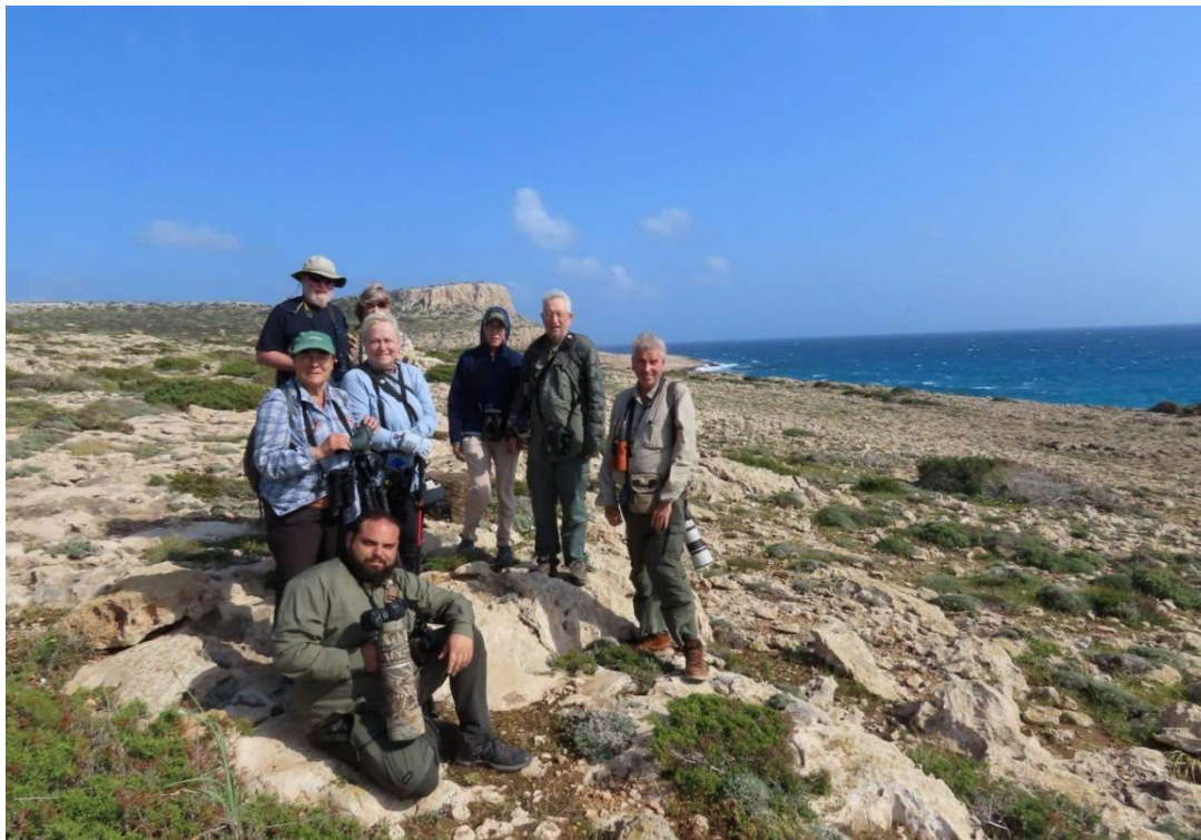
Here we are looking cool at the Cape Grecco Headland