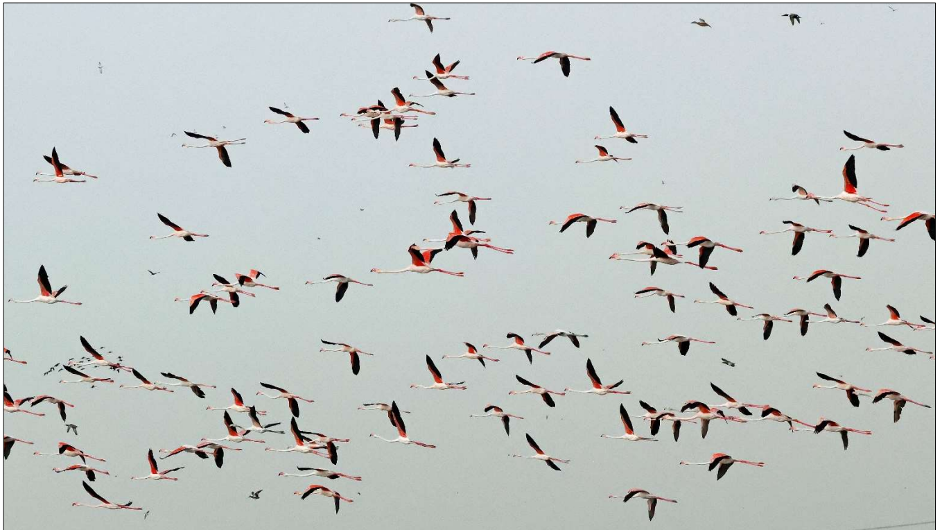
A flock of flying Greater Flamingos at Spiros Pool was something to behold!