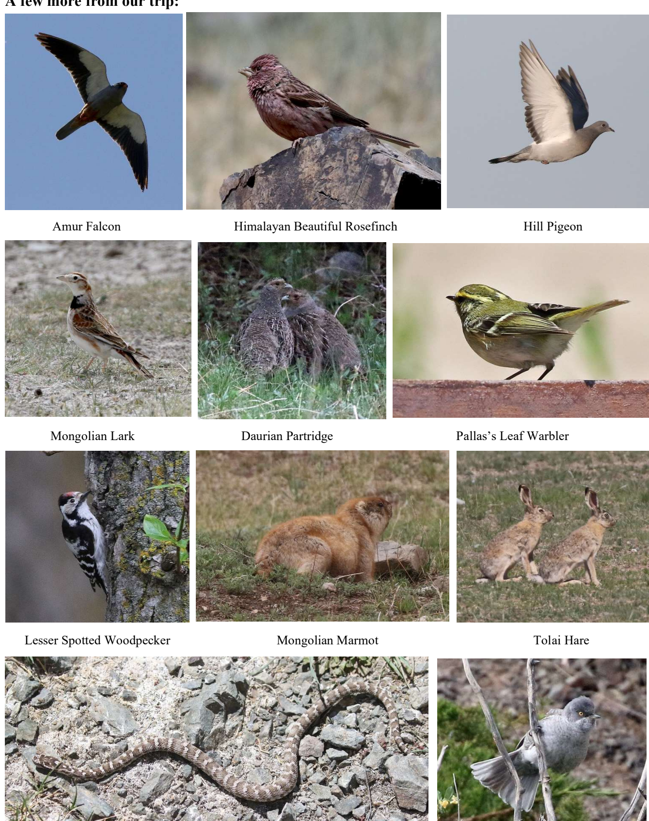
Mongolian Pit Viper