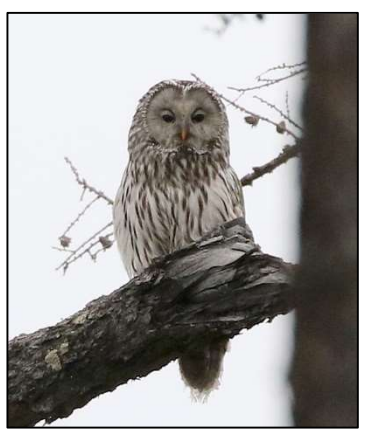
Sunrise Birding LLC & Bird's Wildlife & Nature Tours