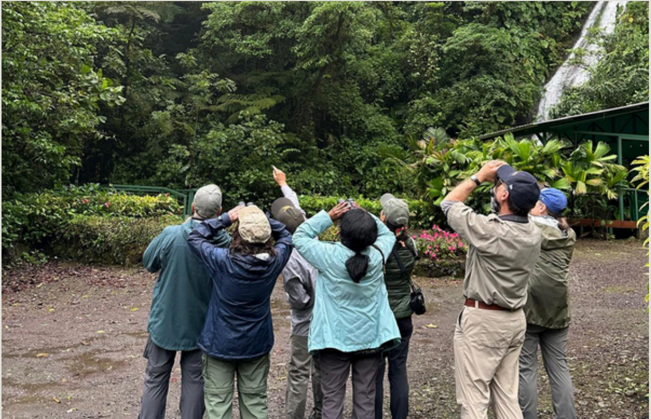
Birding at Hotel Quelitales