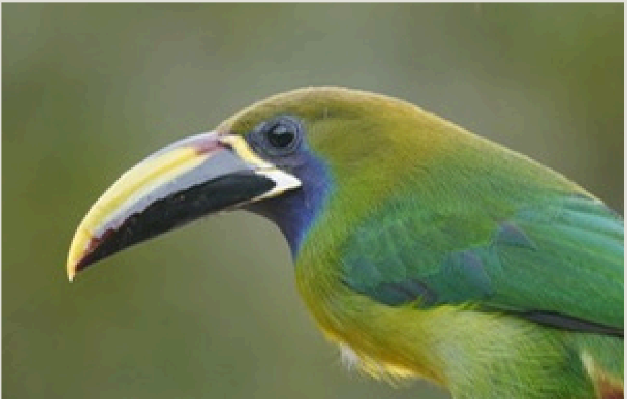
Northern Emerald Toucanet