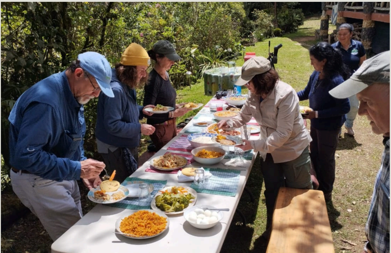
Delicious food at Reserva Robles Mimosos