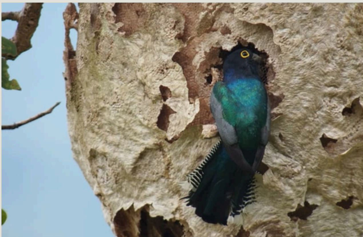
Gartered Violaceous Trogon