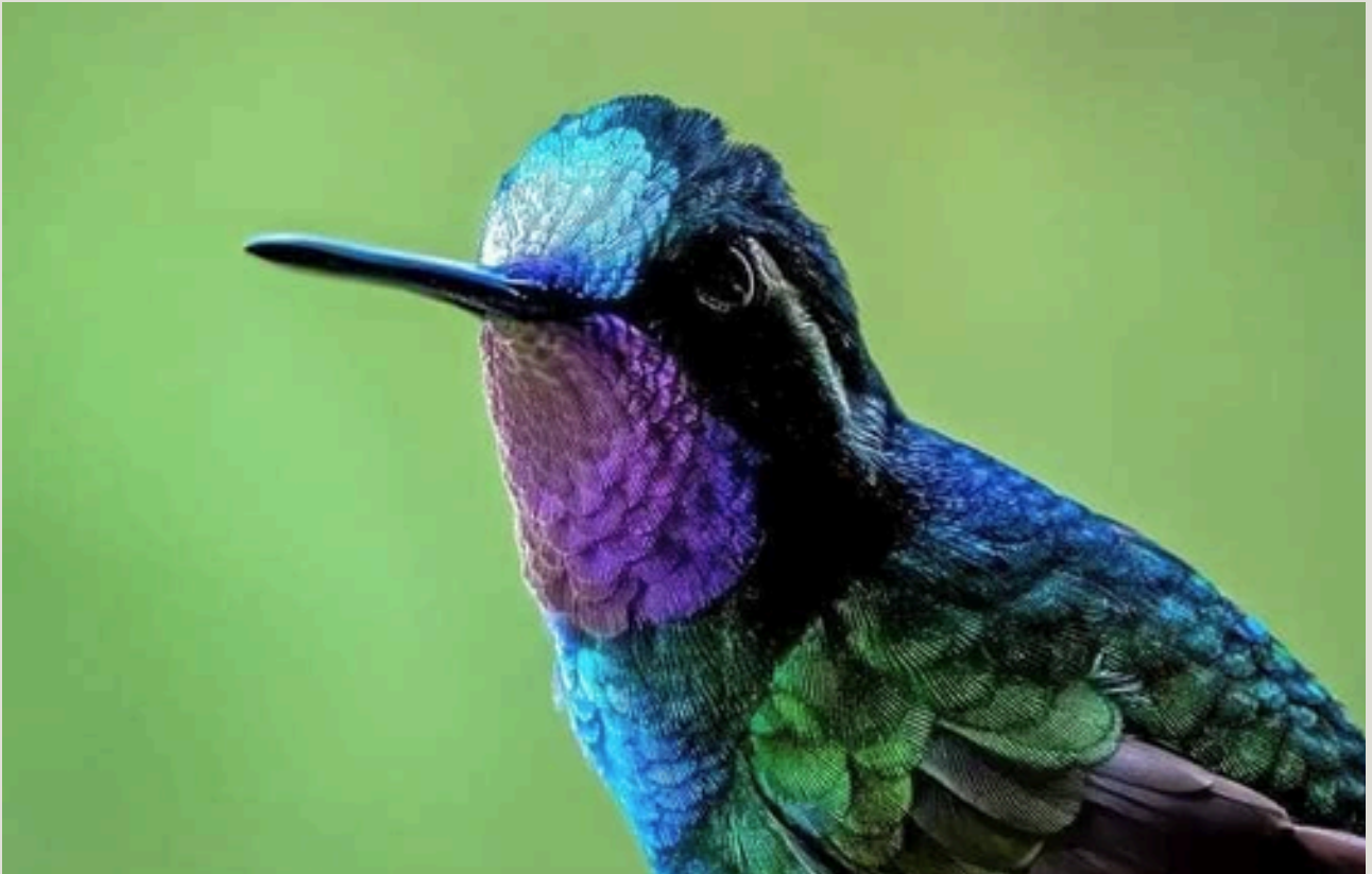
Purple-throated Mountain-gem