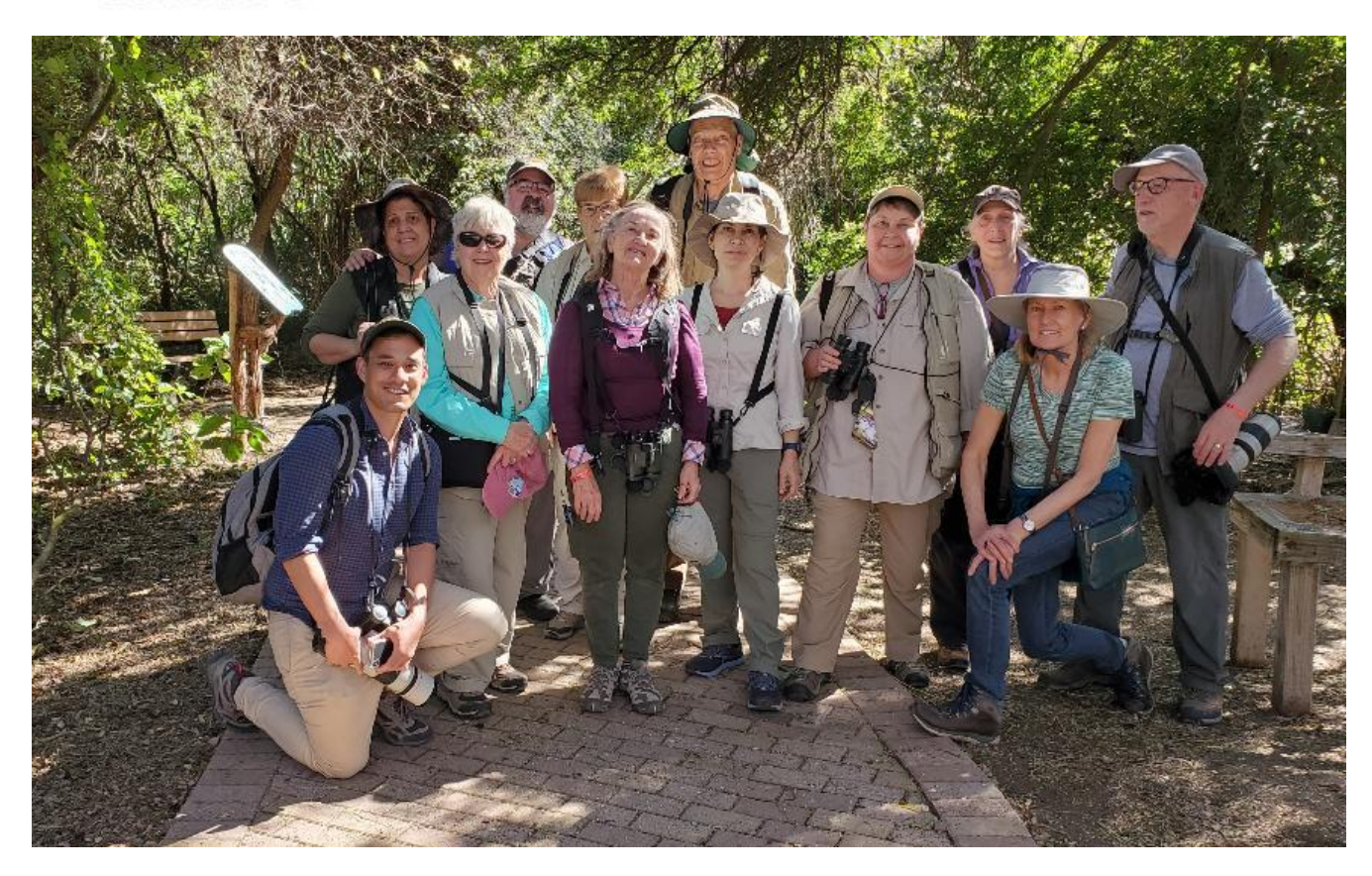
Photo: Our intrepid group of happy birders after seeing Golden-crowned Warbler!