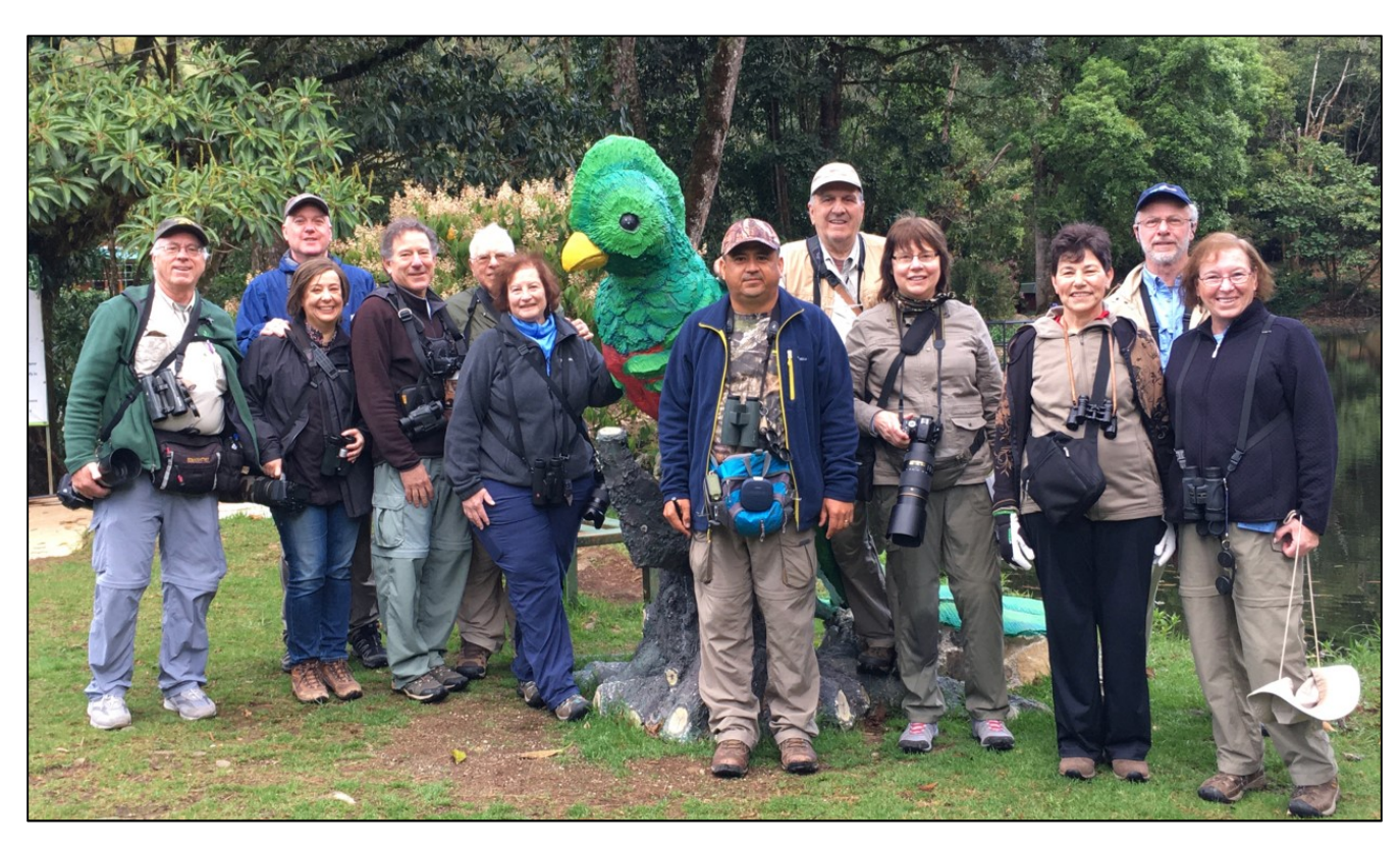
Photos: Talamanca Hummingbird, Sunbittern, Resplendent Quetzal, Congenial Group!