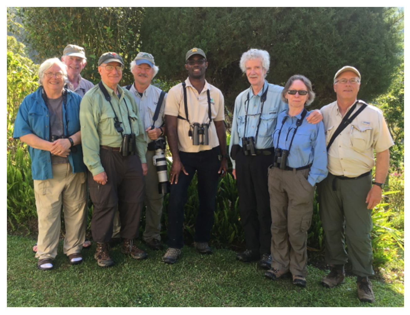
Photos, top to bottom: Jamaican Spindalis, Jamaican Tody, Crested Quail Dove, happy group!