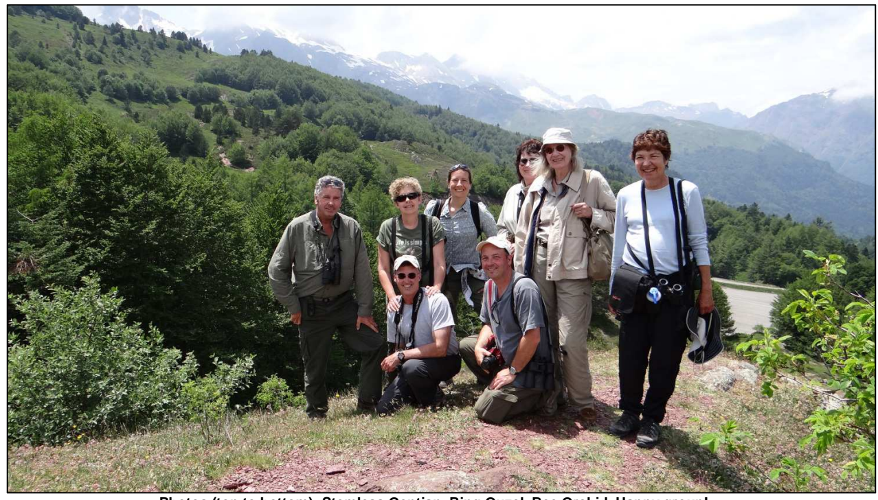
Photos (top to bottom): Stemless Gentian, Ring Ouzel, Bee Orchid, Happy group!