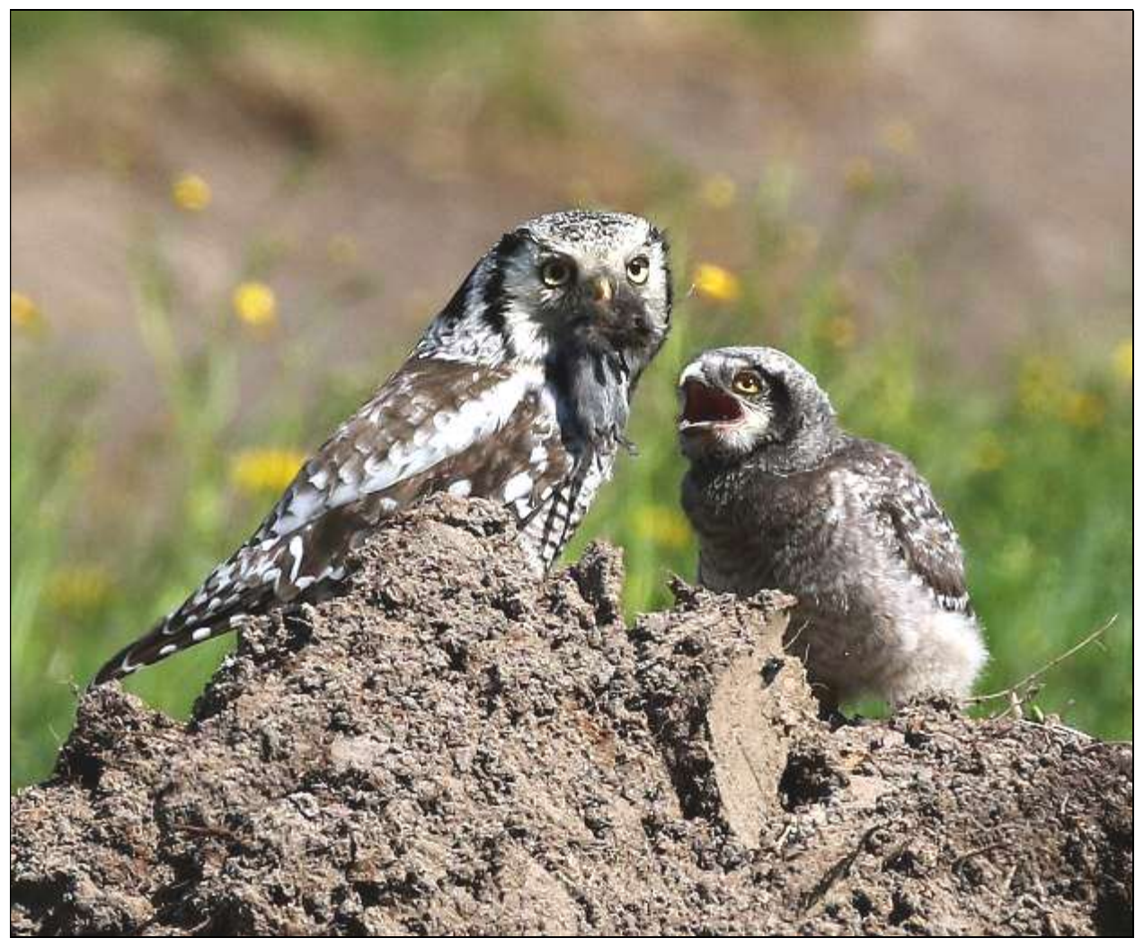
Photos: Black Woodpecker, Willow Grouse, Siberian Jay, Northern Hawk Owl with chick. SUNRISE BIRDING LLC – 2018 FINLAND BIRDING TOUR – TRIP REPORT