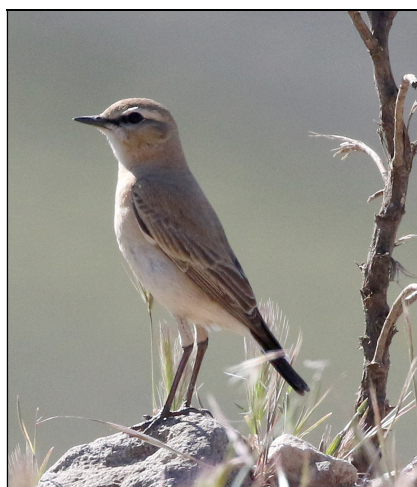
Photos: Montagu's Harrier, Black-eared Wheatear, Isabelline Wheatear, Flamingo