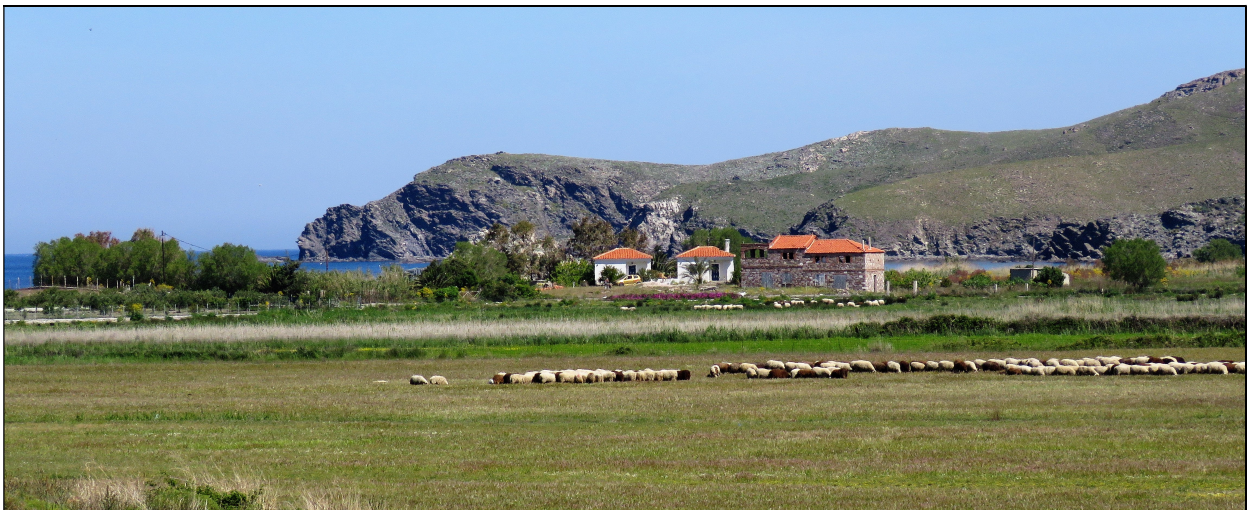
Photos: White-winged Tern, Landscape at Sigri. Below, Squacco Heron