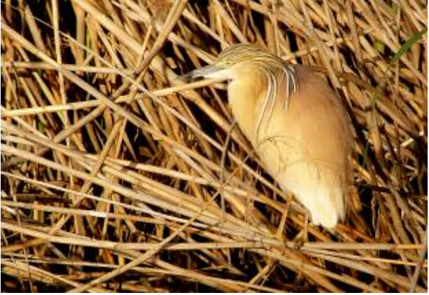
Photos (top to bottom): Great Bittern, Black-eared Wheatear, Black Stork, Wood Sandpiper, Barn Swallow, Little Crake, Black-headed Bunting, Squacco Heron by Gina Nichol.