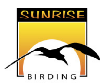
LESVOS April 25 – May 2, 2015 Trip Report & Species List