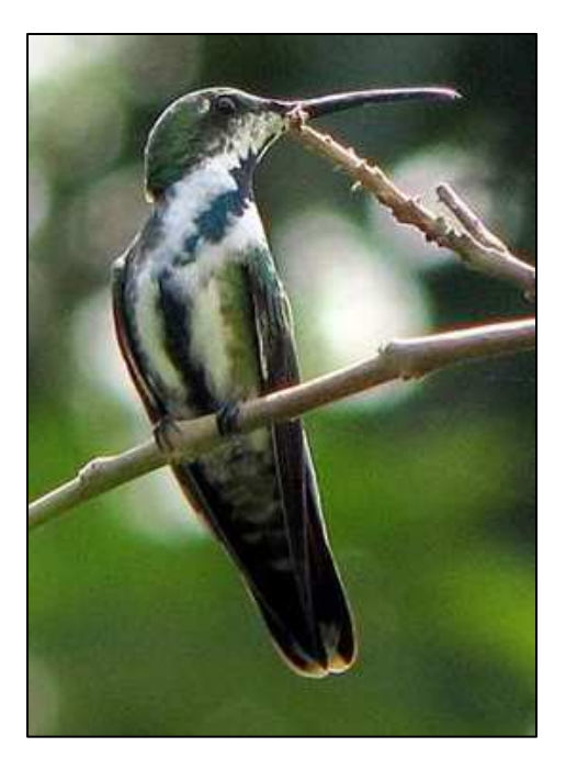
Above: Veraguan Mango Photos in report identified in red bold text.

Everyone arrived at the Canopy Tower after smooth flights during the day. We did some birding from the tower upper deck enjoying great views of the canopy, of the canal area and the city in the background. We enjoyed point-blank views of the very cool Black-headed Tody-Flycatcher perched in a Cecropia and a couple of lovely Short-tailed Hawks that were effortlessly gliding above the canopy looking for prey. We began feeding our mammal list with the neat and lazy Brown-throated Three-toed Sloth. Later on, we assembled for dinner and officially started out 2012 Panama trip!