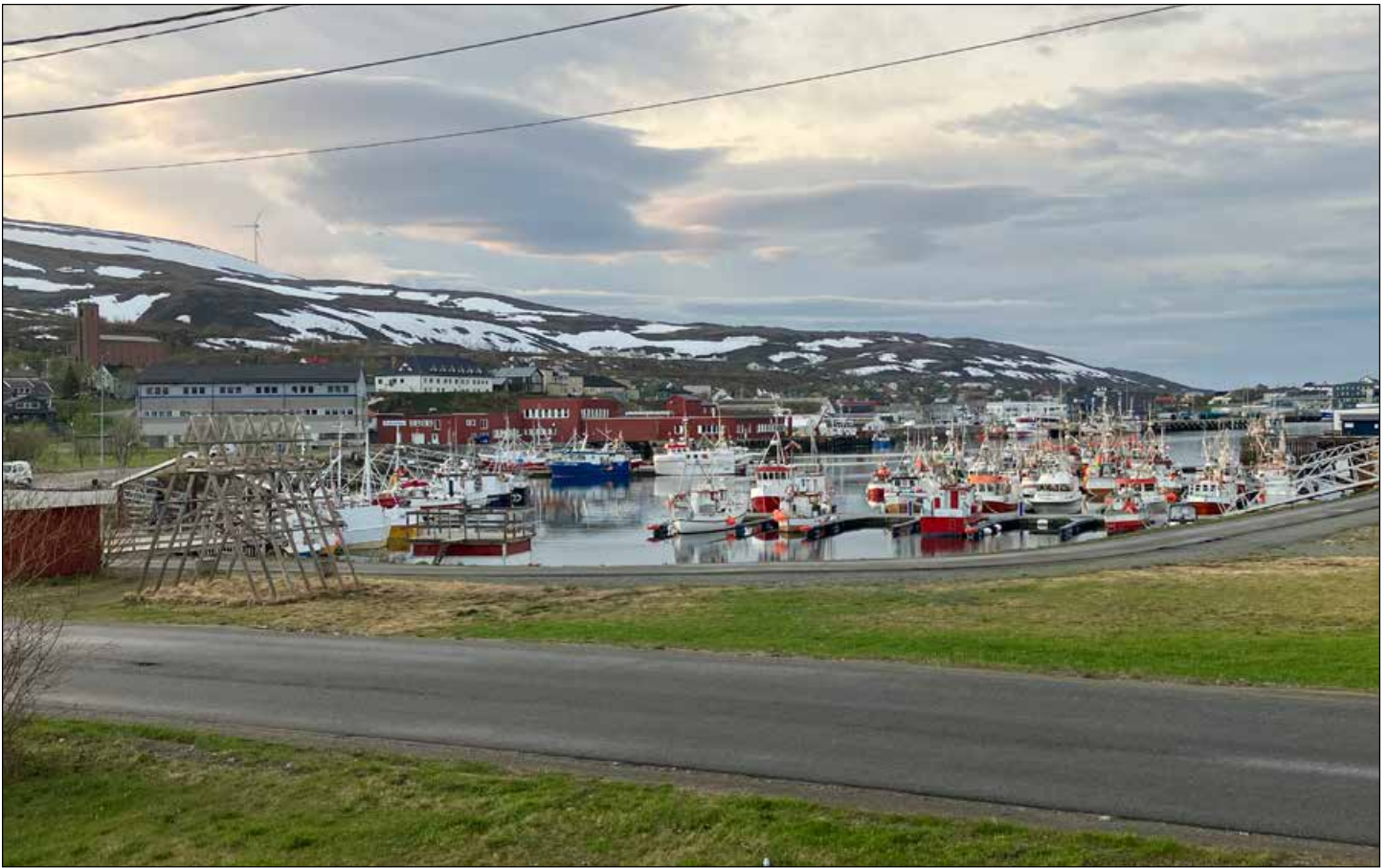
The harbour at Båtsfjord, Norway held Common Mergansers, L-T Jaegers, Kittiwakes and Arctic Terns.