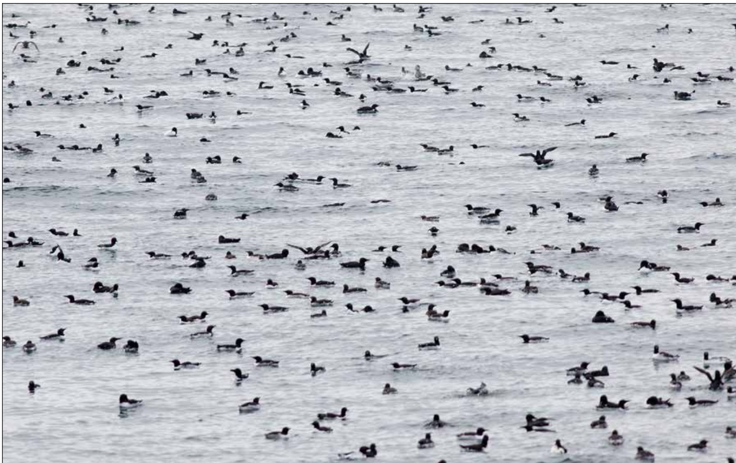
Hornøya Island was an amazing spectacle with thousands of alcids, including great looks at Razorbill (left) and Puffin (right). A highlight of the trip for all of us!