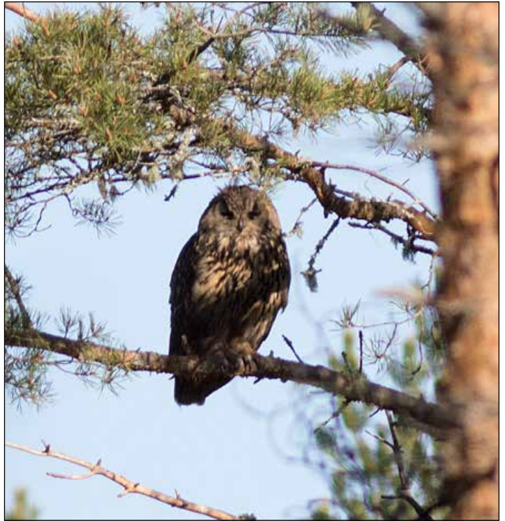
Owls are the star attractions in Finland and we scored with 7 species on the trip including this fine Great Gray Owl on the nest and a more wary Eurasian Eagle Owl.