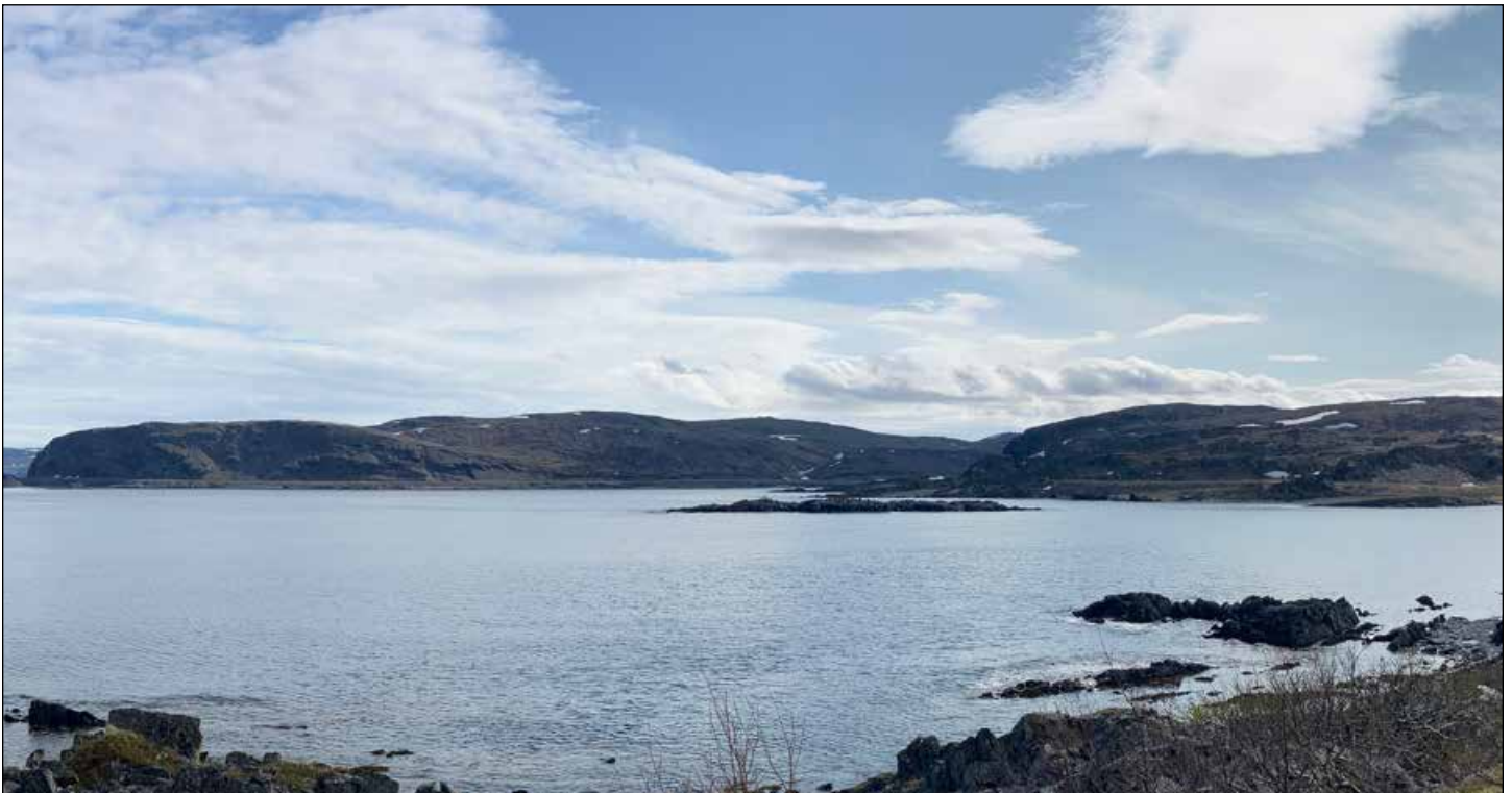
The bays around Hamningberg rewarded us with great views of a flock King Eider and a full summer-plumaged White-billed Diver (Yellow-billed Loon), both difficult species to find this year.