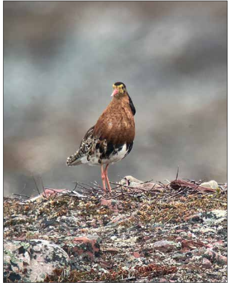
Upland fell species showed well including Rock Ptarmigan (left) and stunning Ruffs (right) in breeding plumage.