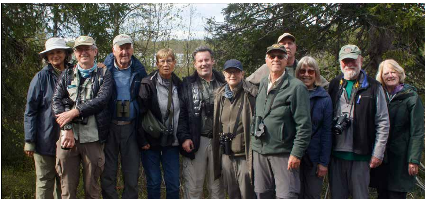
The Sunrise Birding Group.