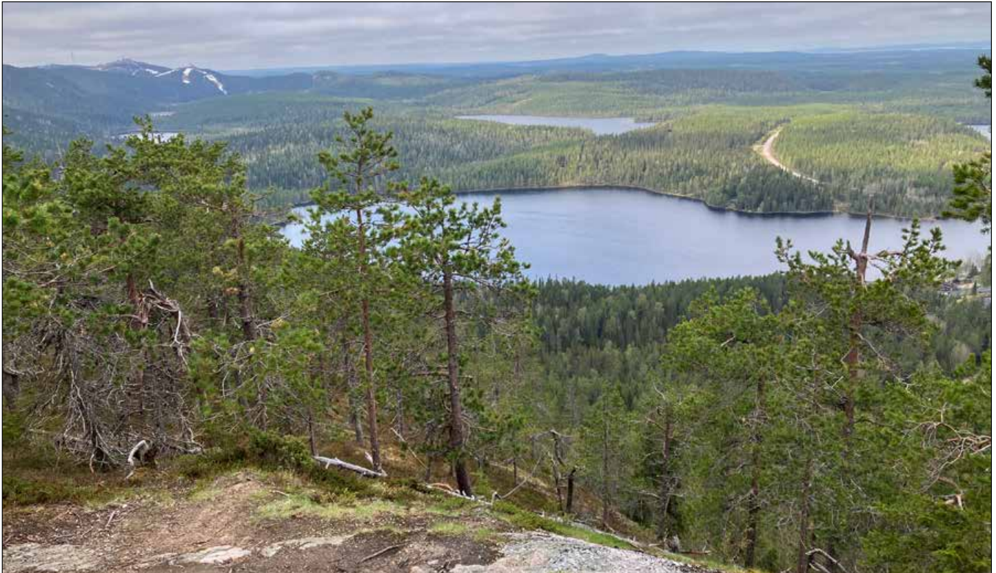
Beautiful scenery from the top of the mountain while looking (successfully) for Red-flanked Bluetail.