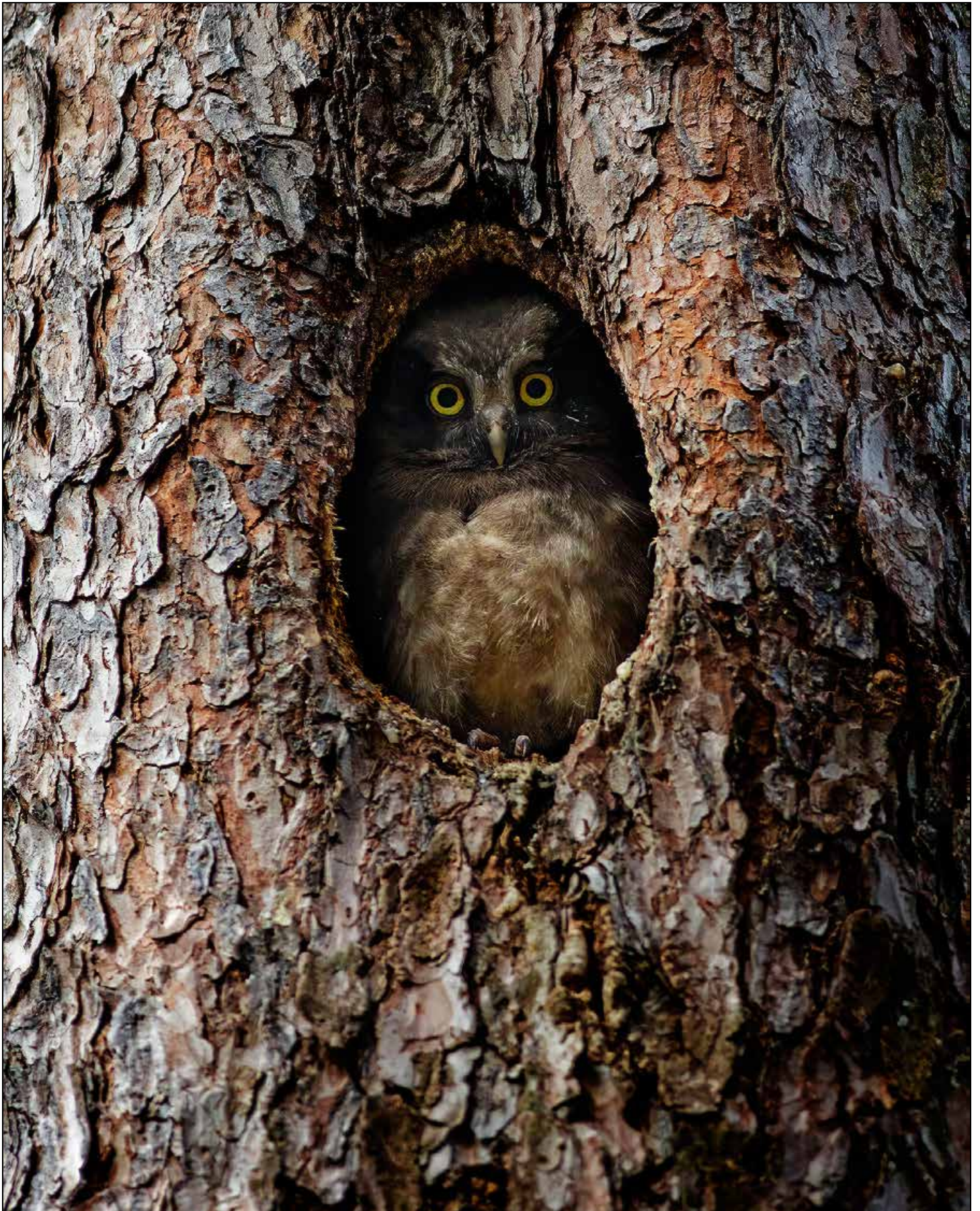
Juvenile Tengmalm's Owl.