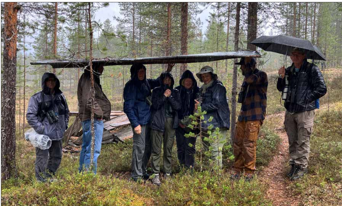
We lucked out with the weather except for a few showers when we had to improvise with a piece of corrugated iron for our “Finnish Umbrella”.