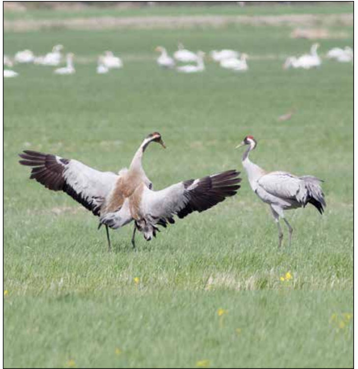
Marsh Harrier and Common Cranes were seen before breakfast from the platform at our Oulu hotel.