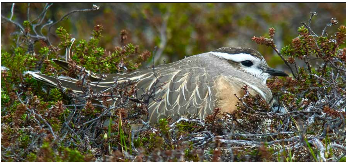
A dapper-looking Dotterel sitting tight for the crowd of admirers.