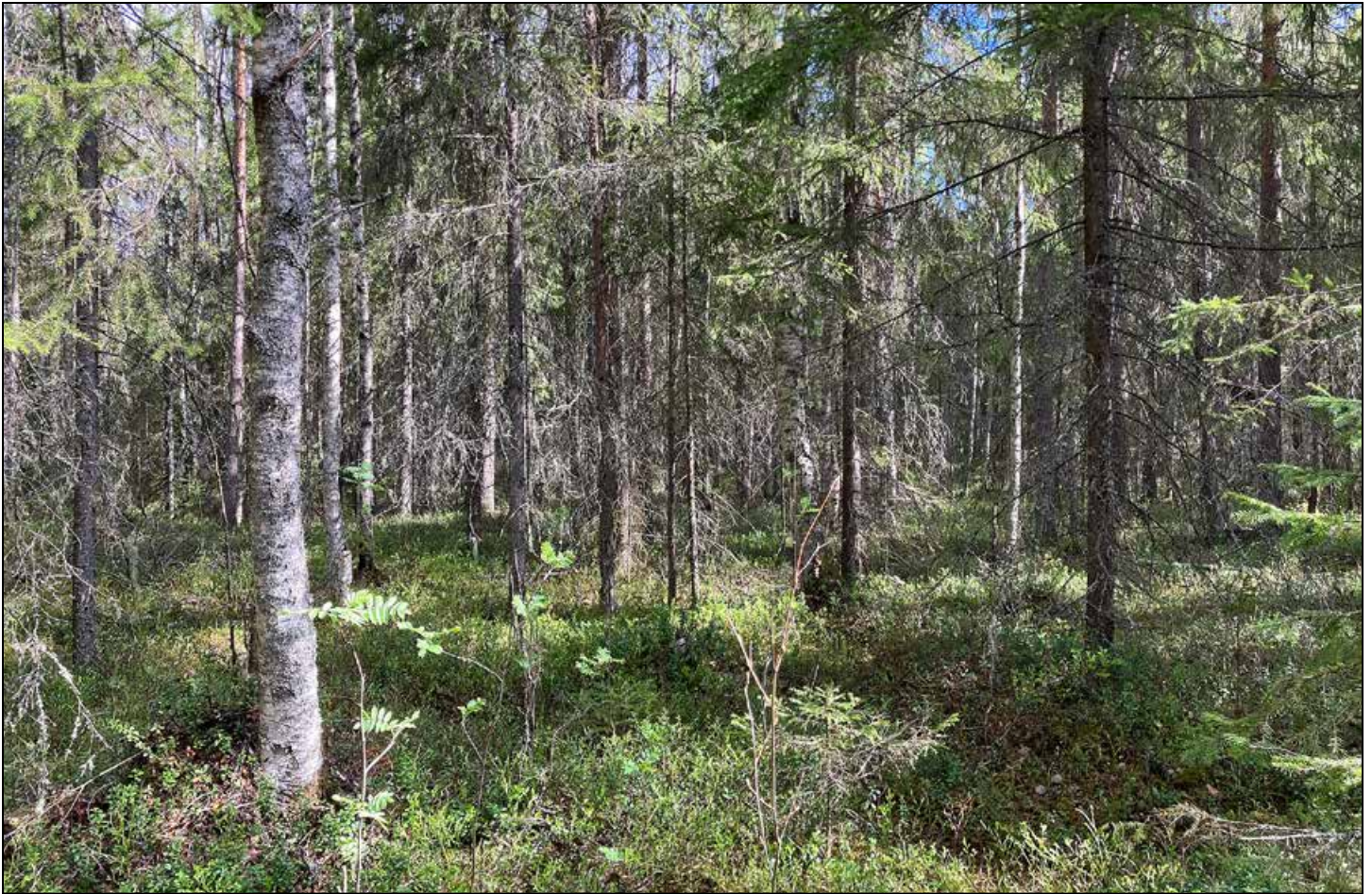
(Top). Beautiful Finnish forest with thick understory - great Capercaillie and Hazel Grouse habitat. (Bottom). Boggy birch forests produced Eurasian Pygmy Owl and Lesser-spotted and Grey-headed Woodpeckers.