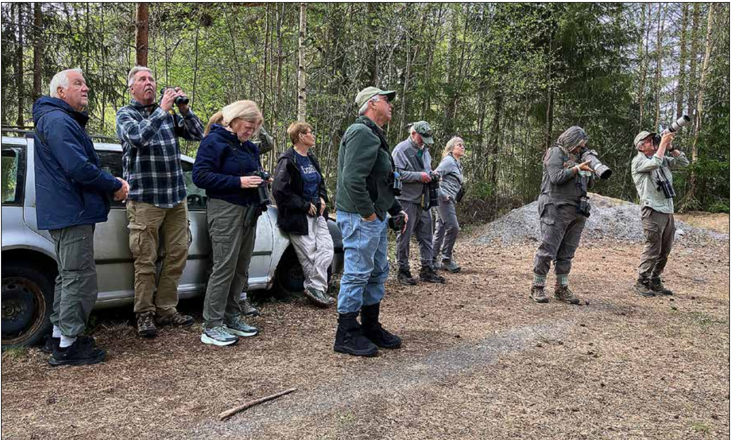
The group taking advantage of a showy Tengmalm's (Boreal) Owl.