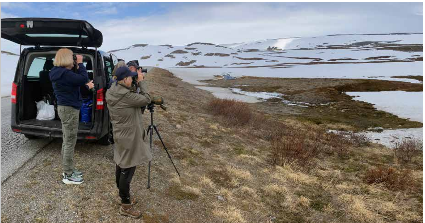
Great panoramic views over the snow-covered fells south of Båtsfjord, Norway with fantastic views of both Long-tailed and Parasitic Jaegers dashing across the snowy hillsides.