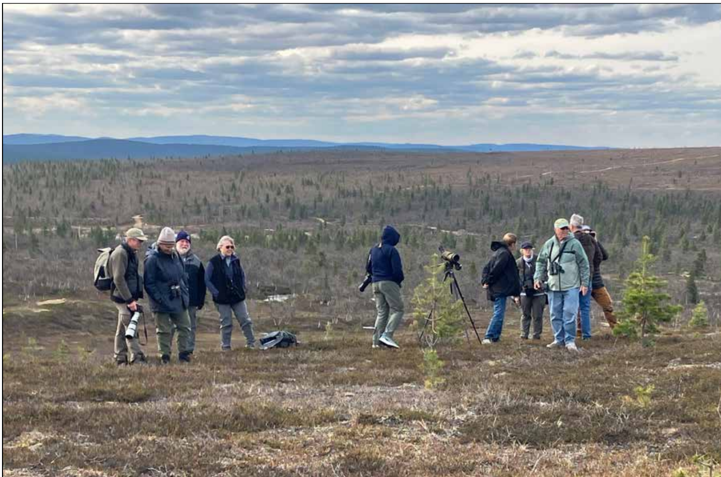
The happy group finally connecting with a big target bird - Dotterel!