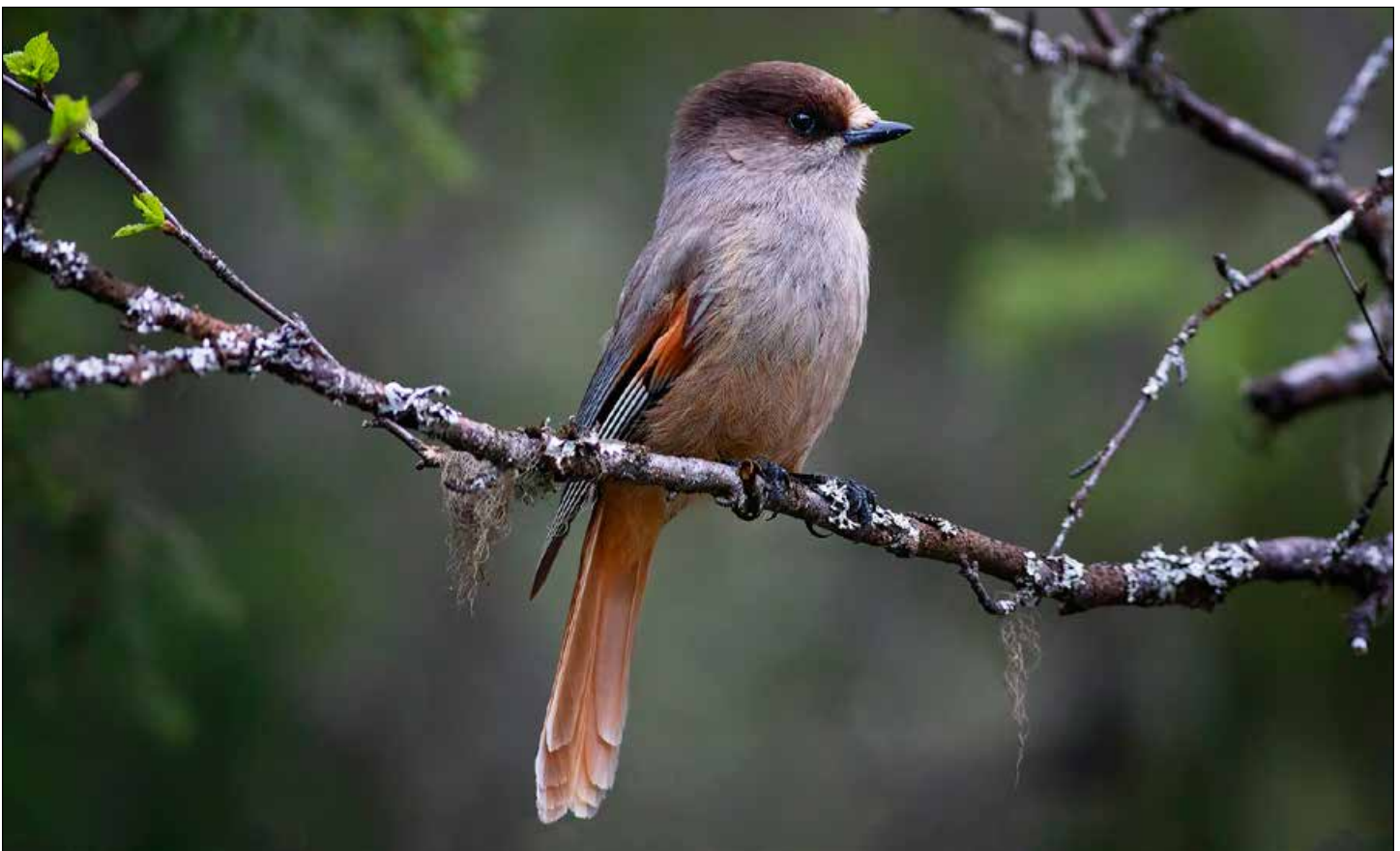
Another showy target bird for the group was the endemic Siberian Jay.