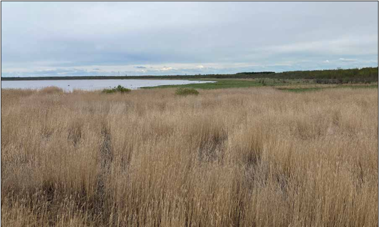
View from the platform behind the hotel at Oulu.