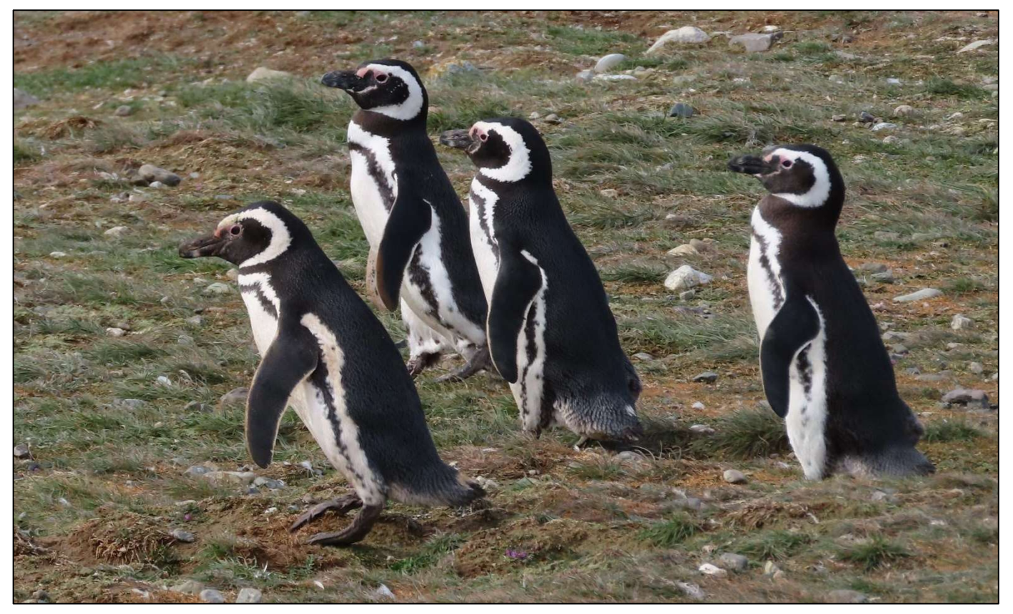
Photos: Andean Condor, Pumas, Elegant Crested Tinamou. Magellanic Woodpecker, Magellanic Penguins.