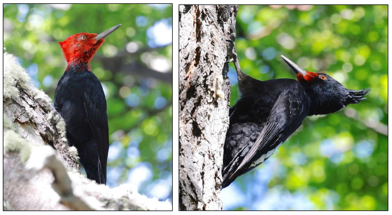
Magellanic Woodpecker